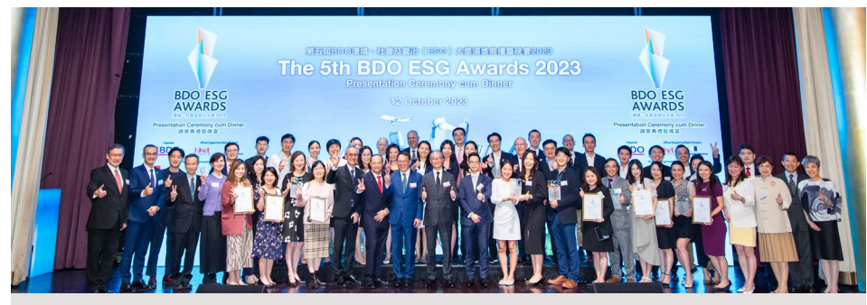
Representatives from all finalist companies of the BDO ESG Awards 2023 celebrated their achievements with representatives of BDO, judging panel, supporting organisations and media partners at the Awards Presentation Ceremony

Congratulations to all Awards Winners and big thanks to our professional judges who have applied their expertise and rich experience to select the Awards winners while ensuring the credibility and representativeness of the Awards.