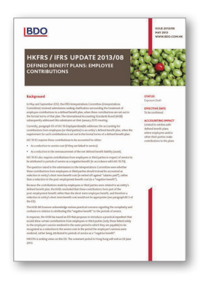
HKFRS / IFRS UPDATE 2013/08 Defined benefit plans: employee contributions

VALUATION BULLETIN Overview of new fair value measurement