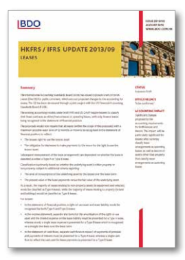
HKFRS/IFRS Update 2013/09 Leases