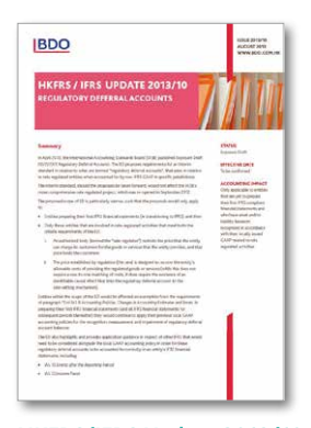
HKFRS/IFRS Update 2013/10 Regulatory deferral accounts