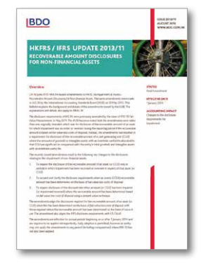
HKFRS/IFRS Update 2013/11 Recoverable amount disclosures for non-financial assets