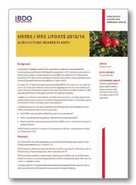
HKFRS/IFRS Update 2013/14 Agriculture: bearer plants